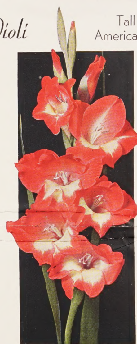
WURTEMBERGIA $1.50 for 10 $12.50 per 100